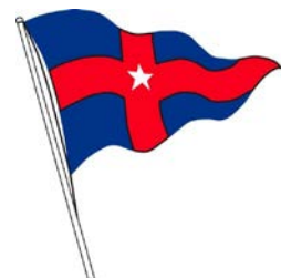
New York Yacht Club